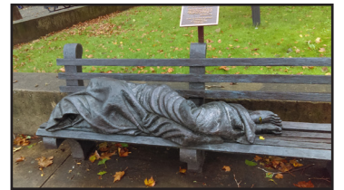
Homeless Jesus Sculpture outside St. Paul's