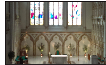
St. Joseph Cathedral