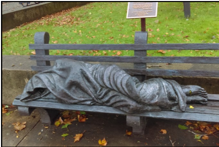
Homeless Jesus Sculpture outside St. Paul's