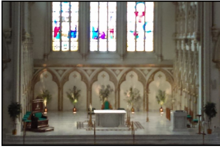
St. Joseph Cathedral