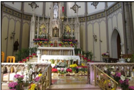
St. Louis Church